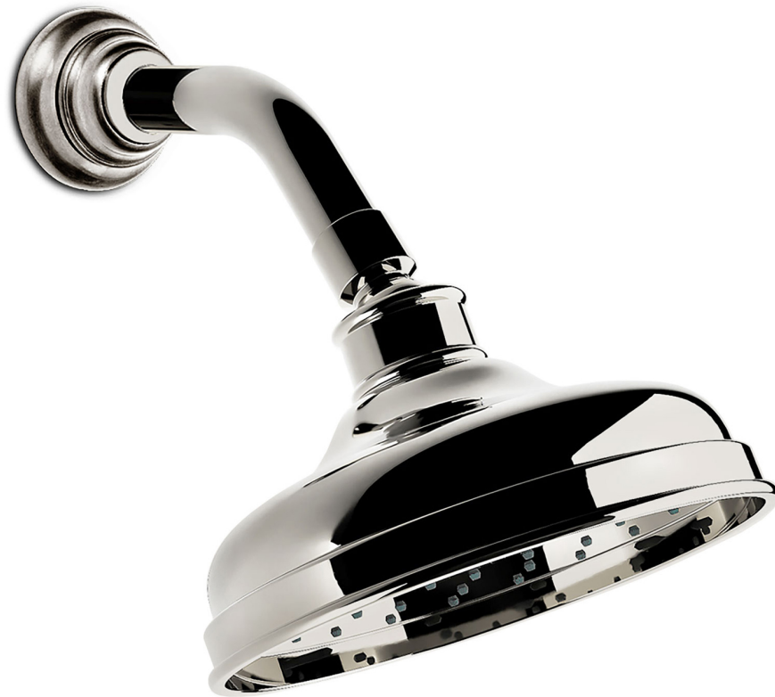
Shower Head 15 no results