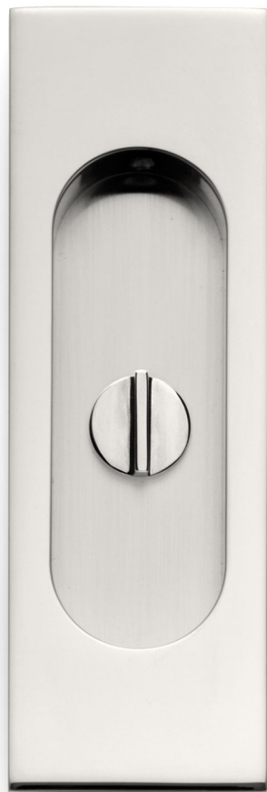
N° 6050T no results