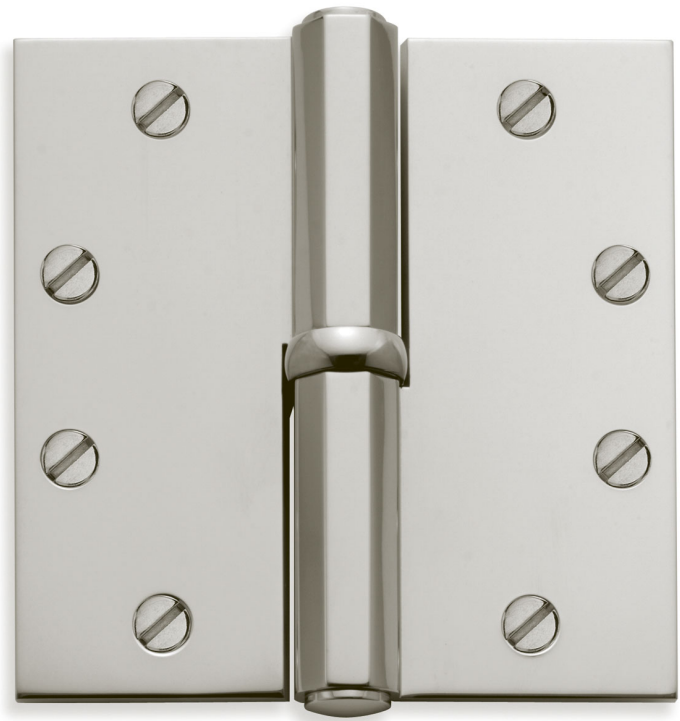
N° 3581 no results