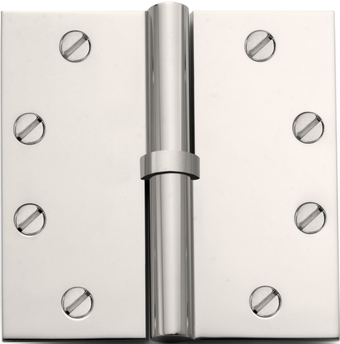
N° 3580 no results