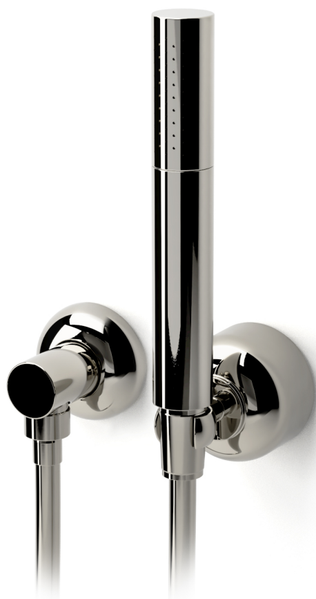
Hand Shower 69 no results