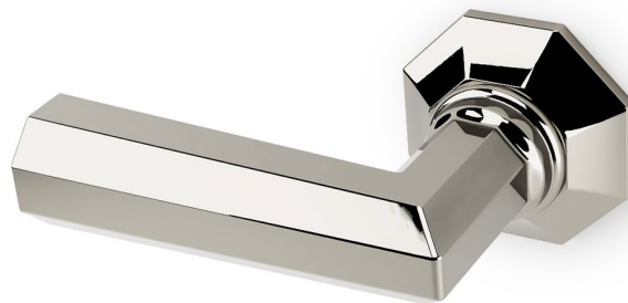
Toilet Lever 37 no results