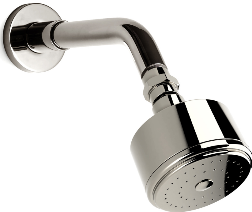
Shower Head 02 no results